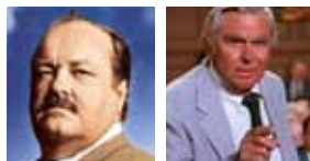
Anyone under 40 know who these stars are?